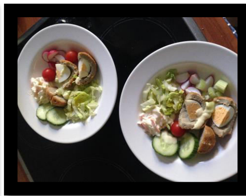
Scotch egg with a salad