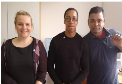
Some Attendees from DF awareness programme held in Enfield on 31 st March 2015

Nothing is too small to ignore ..... Or too big to achieve....., if you really care