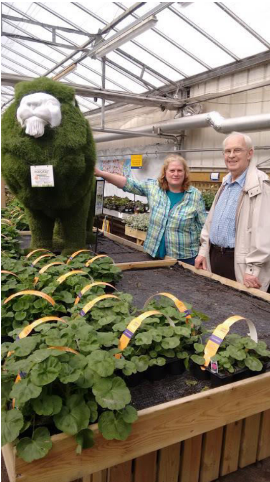
Visit to Garden Centre